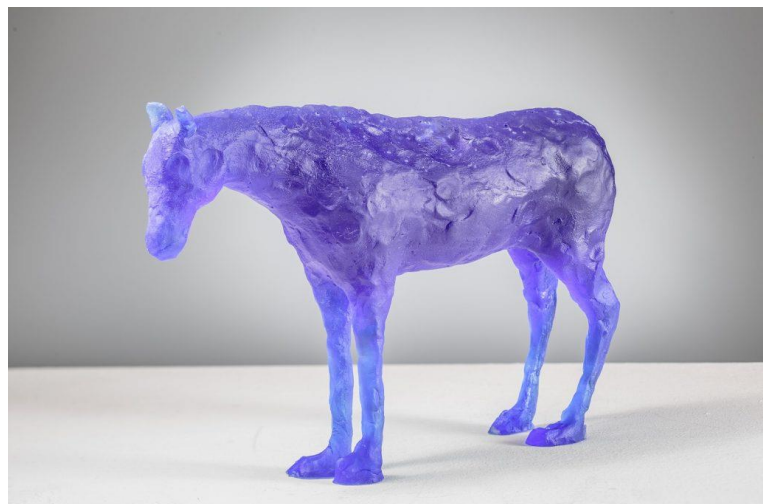
Detail of an ocean away , Ugo Rondinone (2017). Glass.

In the context of this installation, the reappearing motif of a horse (which has a long tradition in the history of art), evokes alienation and a subversive twist emblematic of Rondinone's works.