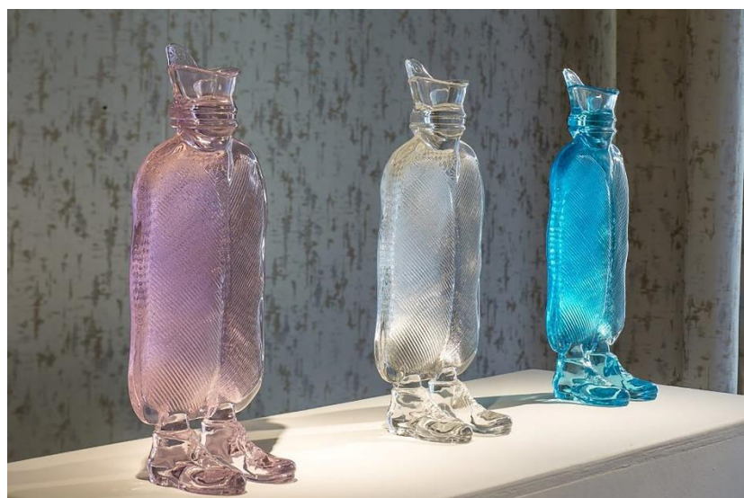
Mutter , Erwin Wurm (2018). Glass.