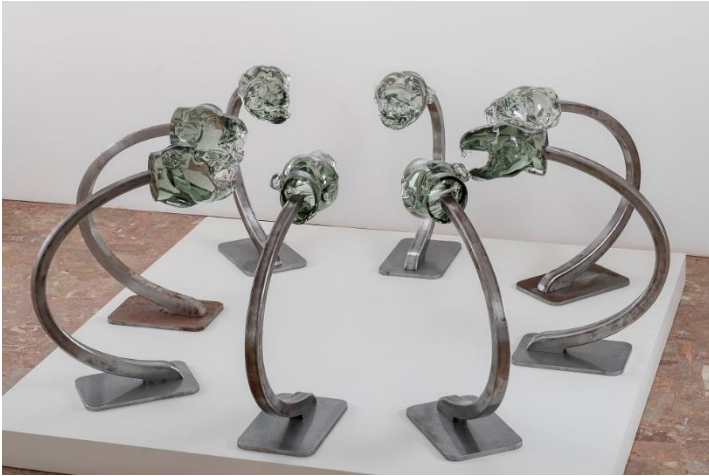
Strike Twice , Jimmie Durham (2019). Glass and metal.