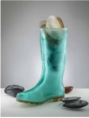
Palimpsest (Made in Italy) , Andrew Huston (2020). Cast glass.