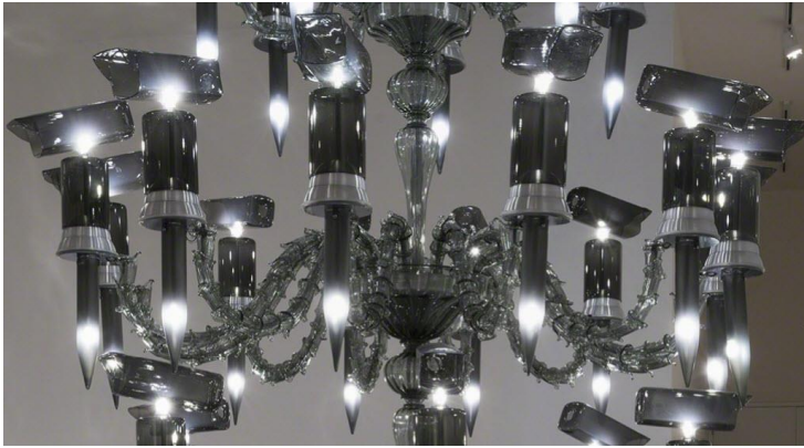
Detail of Glass Big Brother , Song Dong (2015). Glass and metal.

This show also unveils the Museum’s new acquisition for its collection, created in the Berengo Studio – Glass Big Brother , a sculpture by Song Dong, one of contemporary Chinese art’s leading figures.