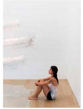
Time , Penzo + Fiore, an artistic duo who live and work in Venice (2018). Video, color, sound.