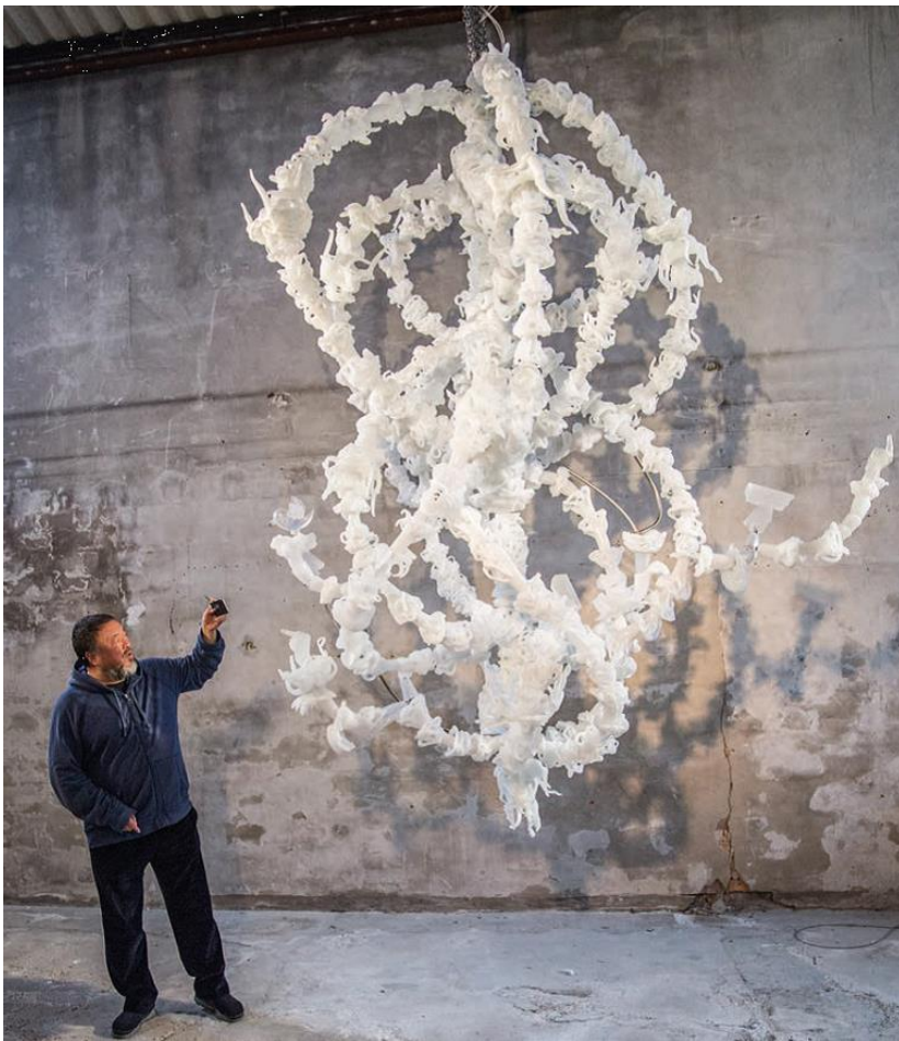
Ai Weiwei at the Glasstress studios, next to his spectacular glass sculpture.