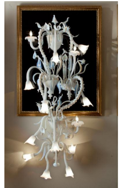
Sala Longhi , Fred Wilson (2011). Glass and wood.

View stunning images from cities around the world that have hosted previous Glasstress exhibitions at this link: